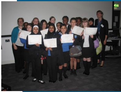
Student researchers receive their certificates at Goldsmiths University

'I don't want it to change because it is ok the way it is now'