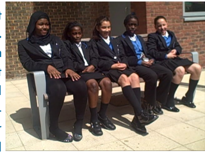
Year 7 students agreed to share their views as part of a focus group discussion

about how strict they were. Maybe when they think about it privately and are not influenced by their friends, they tell the truth". In the online survey they found that a majority of students thought that behavior around the Academy had improved since the new rules were introduced. Students also