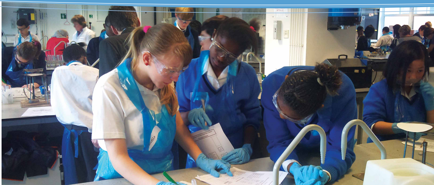
Our young chemists on their way to winning a prize at the Salter's Festival of Chemistry.