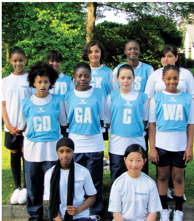
The high-flying Year 7 netball team.