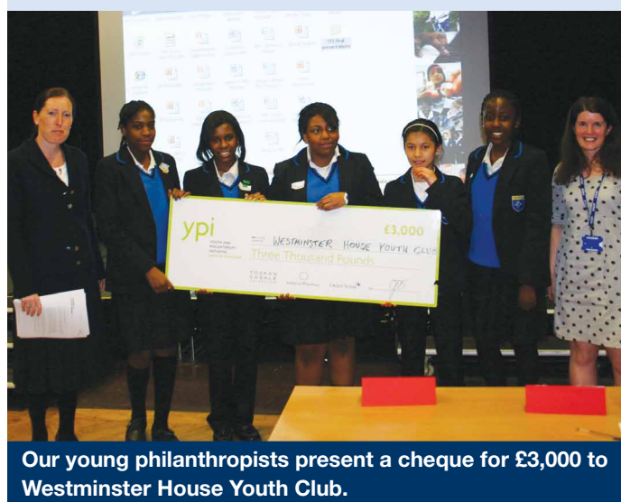
Our young philanthropists present a cheque for £3,000 to Westminster House Youth Club.

The competition was part of the Youth and Philanthropy Initiative, a national programme that has so far reached over 10,000 young people and given £180,000 to local charities.