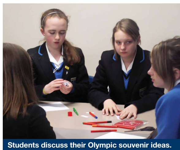
Students discuss their Olympic souvenir ideas.

They went on to the final of the event, competing against other Harris Federation schools, where they were just pipped to the post for top spot.