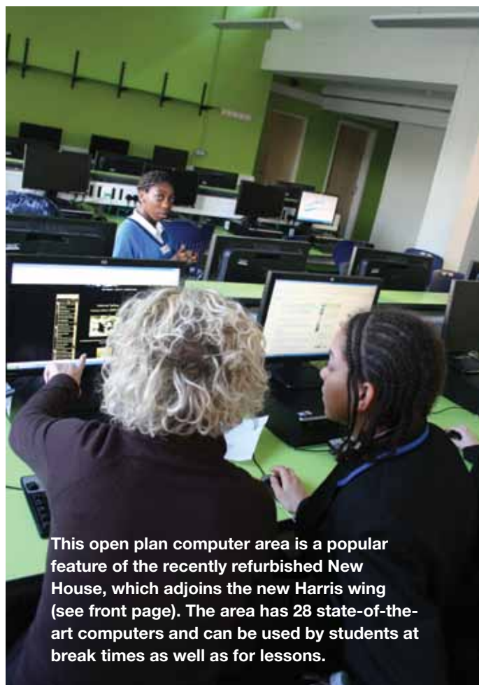
This open plan computer area is a popular feature of the recently refurbished New House, which adjoins the new Harris wing (see front page). The area has 28 state-of-the-art computers and can be used by students at break times as well as for lessons.