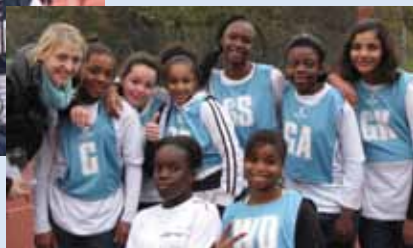
Year 8 netball team ▶