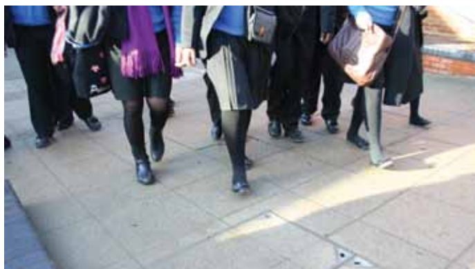
... moving calmly