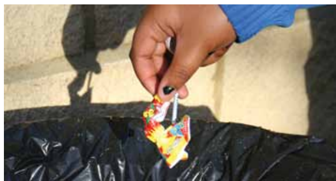
... binning litter