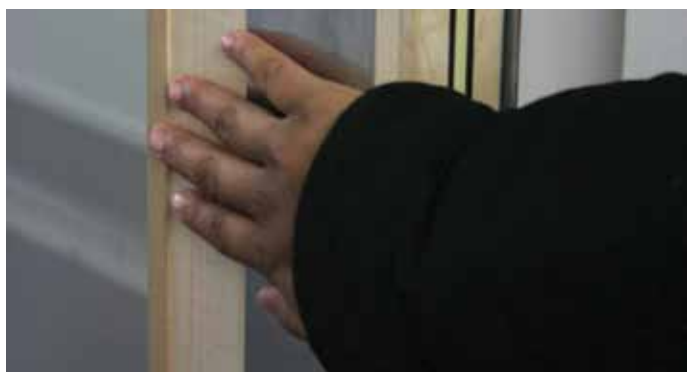
... showing courtesy to others

Mystery scouts are walking around the academy looking out for students who are contributing to the community, as part of a new campaign created by students themselves.