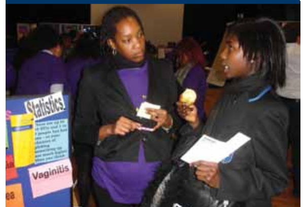
Discussing sexual health at the 2010 academy Health Fair.