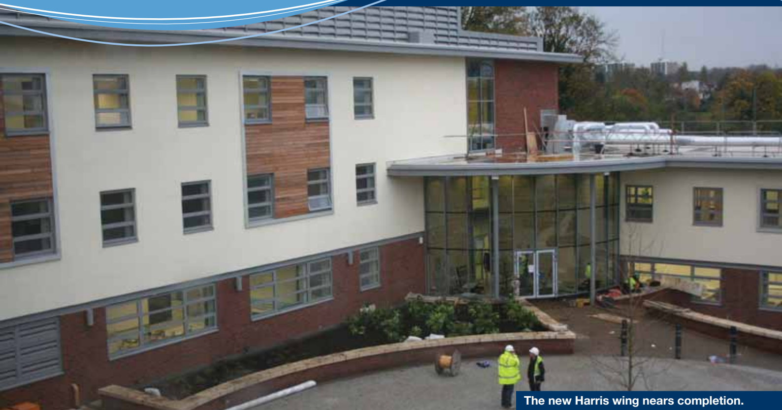
The new Harris wing nears completion.