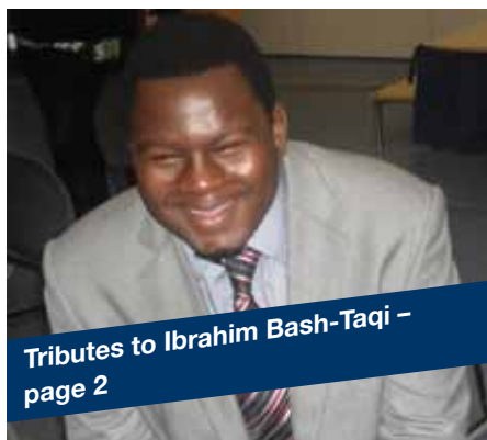
Tributes to Ibrahim Bash-Taqi – page 2