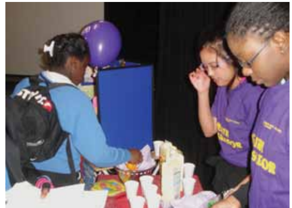
Visiting the healthy drinks stall.

Visitors were asked to evaluate the event by choosing their favourite stalls.